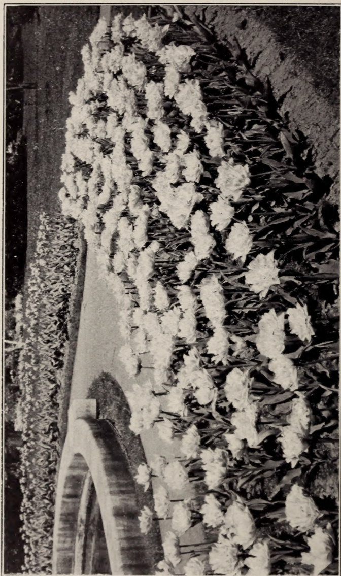
PLANTING OF DOUBLE TULIPS